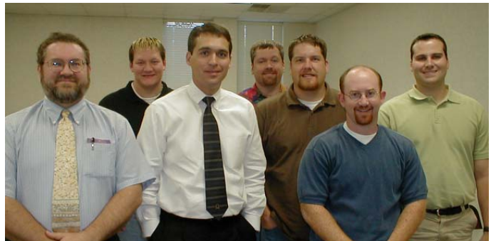
Students Meeting for First Arkansas Classes

Registration Deadline is November 21, 2003