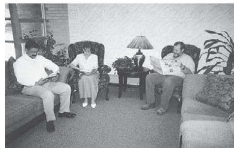
Students Enjoy Eddy Parlor

"Our previous program was outdated with no technical support available. Athena makes it possible to check out books, access our catalog from anywhere, will save time and provides better searching tools," according to Blaylock.