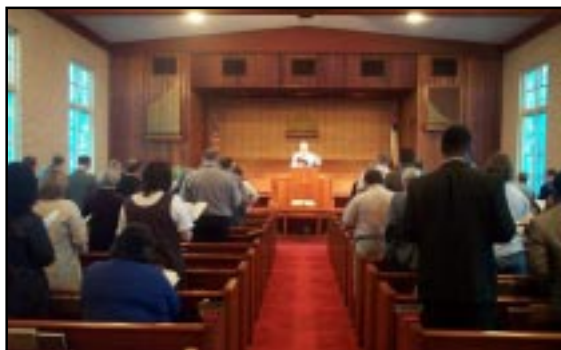
BMA Seminary Chapel Service

BMA Seminary has been privileged through the years to enjoy designated chapel services during regular fall and spring semesters.